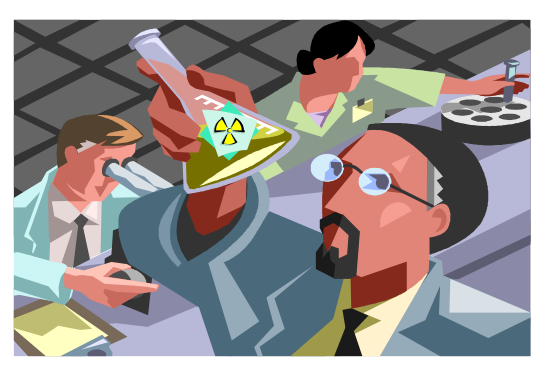
the RSD as needed.